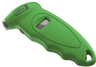
Pressure Gauge 806109